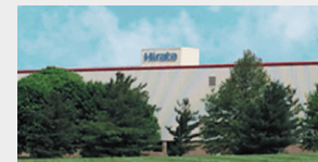
Detroit (New Hudson)

Hirata Engineering S.A.de C.V (Mexico) Est.2000